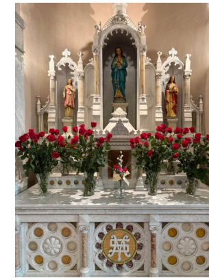
St. Mary's Altar, Mother's Day

DIOCESE OF BELLEVILLE 222 South Third St., Belleville, IL 62220 618-277-8181 www.diobelle.org Subscribe to The Messenger at 618-233-8670, or online at www.bellevillemessenger.org