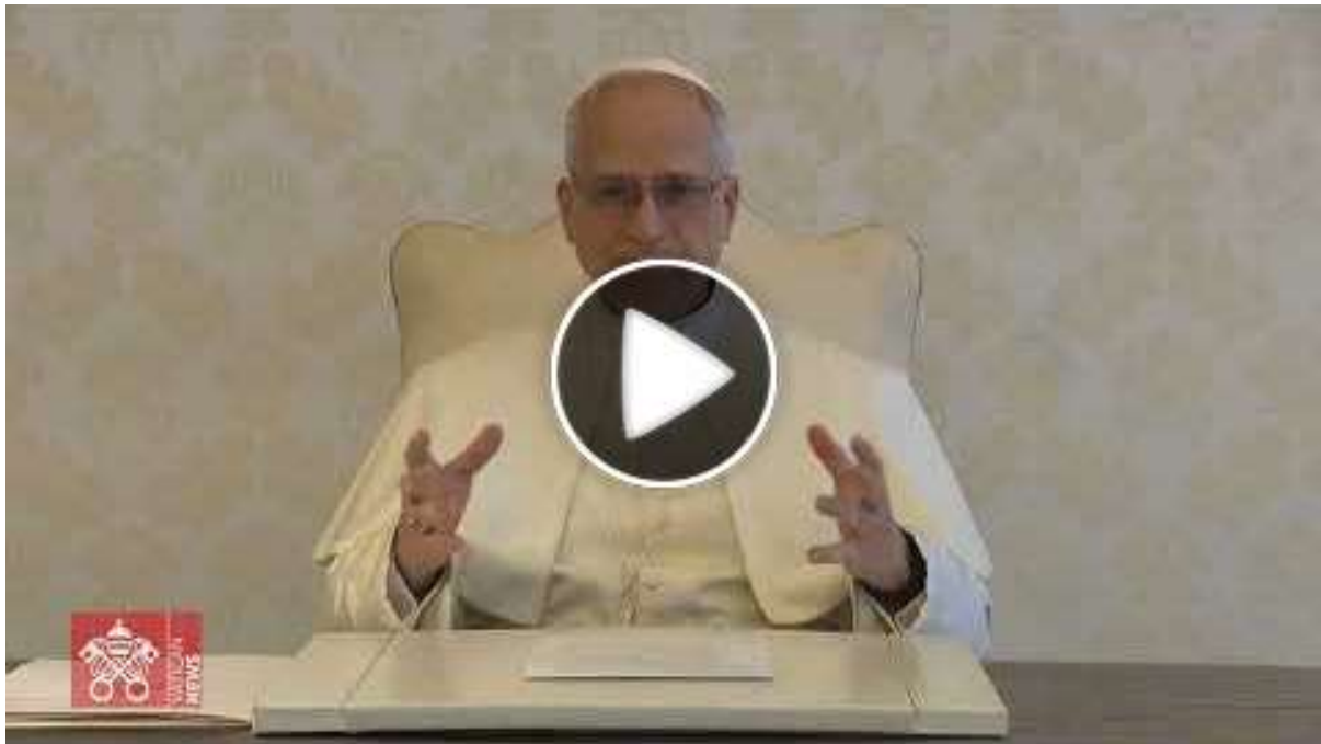
Video Message of the Holy Father to the young people of Chicago and the whole world.

Hospitality is often called "the Benedictine charism." Monasteries are typically known for their hospitality. But hospitality is also a basic Christian charism. Often, we think of hospitality as serving doughnuts or the industry of hospitality. But for the Christian disciple, hospitality is founded in the very first days of creation. As we read the first chapter of Genesis, we see darkness welcoming the light, the sea welcoming the land, the land welcoming the plants, the plants welcoming the animals, and the animals stepping aside enough for the human beings to find a place. Hospitality is the welcoming spirit that is hard-wired into all of us because of creation. Disciples of Jesus learn, as adults, to transcend the mindset of stranger-danger and to embrace openness, especially for the least of our brothers and sisters. How are our parishes at welcoming others? Do we all see ourselves as ministers of hospitality, not only at Mass, but all week long?