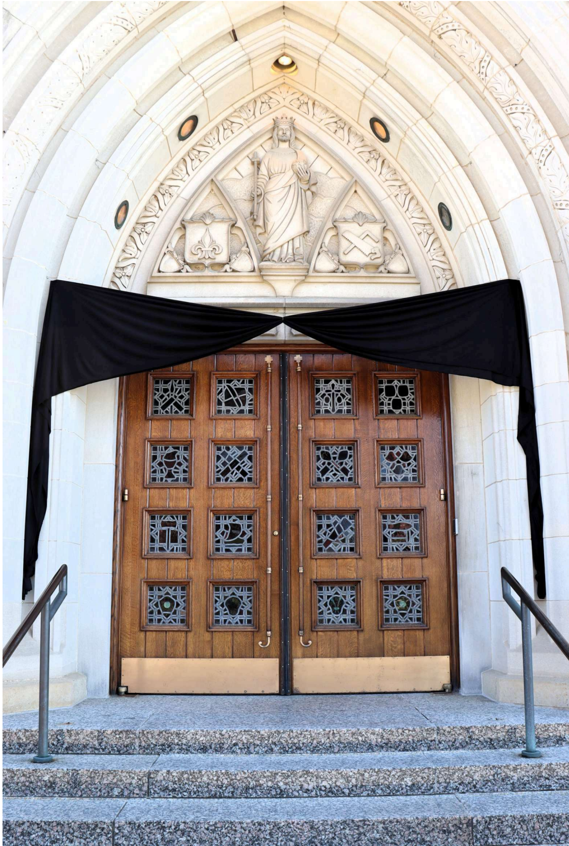
A black drape hangs above the doors at the Cathedral of St. Peter in Belleville as a sign of mourning.